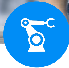
Industrial & IoT